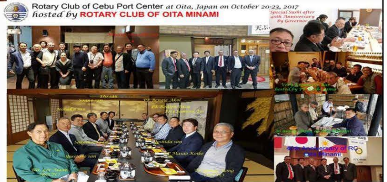
Rotary Club of Cebu Port Center at Oita, Japan on October 20-23, 2017 hosted by ROTARY CLUB OF OITA MINAMI