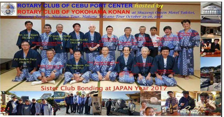
Sister Club Bonding at JAPAN Year 2017