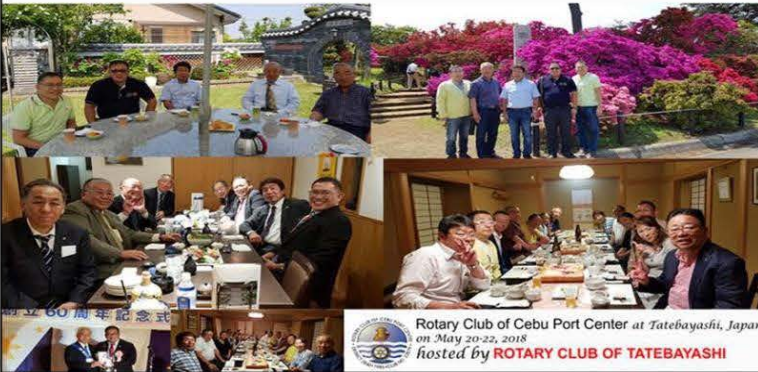
Rotary Club of Cebu Port Center at Tatebayashi, Japan on May 20-22, 2018 hosted by ROTARY CLUB OF TATEBAYASHI